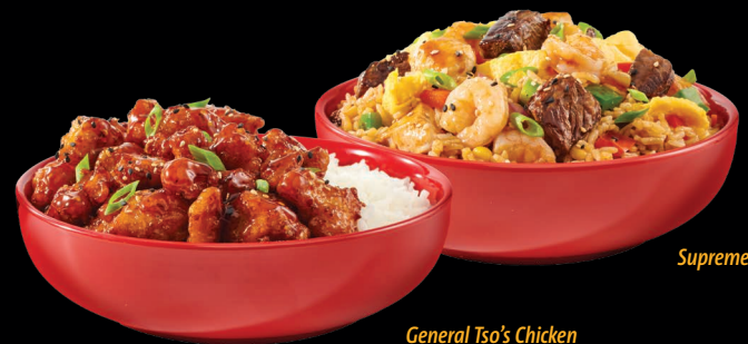
Supreme Fried Rice

Fried crispy chicken tossed with our bold general tso's sauce, topped with toasted sesame seeds, green onions, served on steamed white rice. $12.99