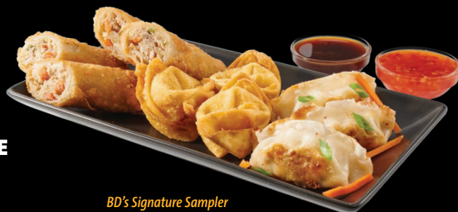
BD's Signature Sampler

Choose any three to share: Korean quesadilla, potstickers, egg roll, or crab rangoon. $14.99