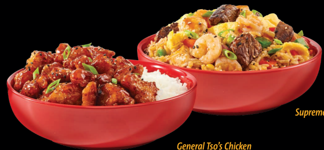
Supreme Fried Rice

Fried crispy chicken tossed with our bold general tso's sauce, topped with toasted sesame seeds, green onions, served on steamed white rice. $12.99