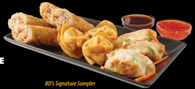
BD's Signature Sampler

Choose any three to share: Korean quesadilla, potstickers, egg roll, or crab rangoon. $14.99