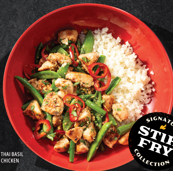
THAI BASIL CHICKEN

Choose any three to share: Korean quesadilla, potstickers, egg roll, or crab rangoon. $14.00