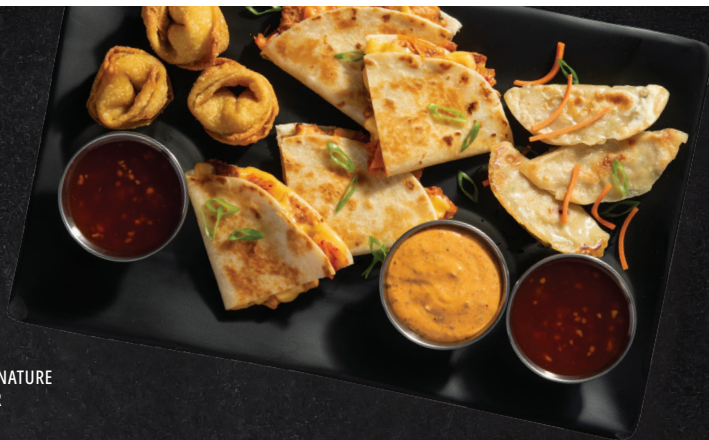
BD'S SIGNATURE SAMPLER

Create your own stir-fry from our world famous fresh market bar. Every bowl comes with choice of white rice, brown rice, tortillas, or lettuce wraps.