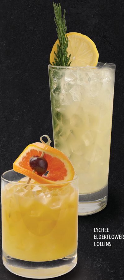
LYCHEE ELDERFLOWER COLLINS

MARGARITA Tequila, triple sec, fresh lime, and citrus sour. Choose from our classic, strawberry, raspberry, watermelon, or mango margaritas. Frozen or on the rocks $7.00